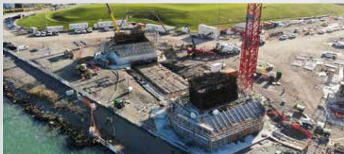
Gordie Howe International Bridge, Canada and USA | Forming and access for new bridge construction | Formwork, falsework, stair towers, access platforms, elevators and engineering

AlumaSafway, Inc. 304-69 Avenue NW Edmonton, AB T6P 0C1 780 440 1692