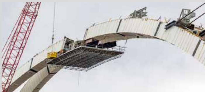
I74 Bridge, Illinois and Iowa | Keystone placement in arch | Truss Frame System, rotating suspension point (RSP) brackets, engineering