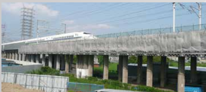
Shinkansen Railway Project, Japan | Retrofitting 90 miles of elevated track | QuikDeck ® Suspended Access System