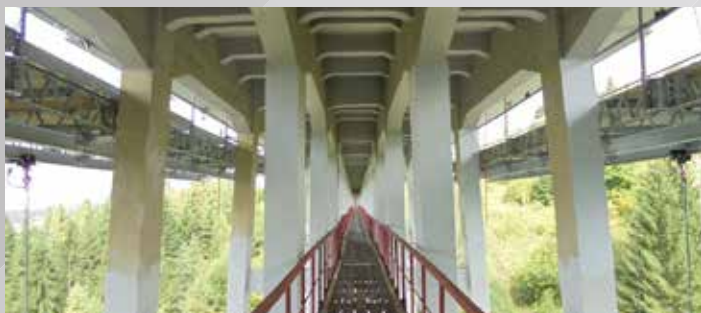
Caracău Viaduct, Romania | Rehabilitation of 264-meter railway bridge | Rope access, QuikDeck ® Suspended Access System, rotating suspension point assemblies, steel monorails and swing stages