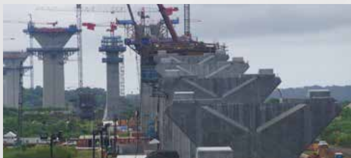
Panama Canal Bridge, Panama | Pier and bridge construction | Aluma Systems ® forming and shoring