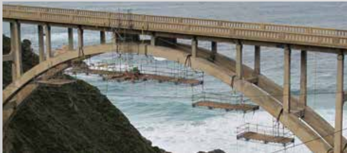
Rocky Creek Bridge, California | Maintaining iconic Pacific Coast landmark | Engineering, QuikDeck ® Suspended Access System