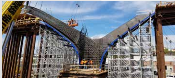
Sixth Street Viaduct, California | New build | Aluma Systems ® custom formwork and heavy duty GASS ™ shoring